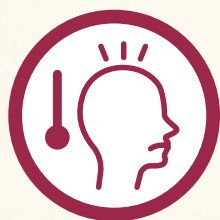
Temperature above 37.8°C

If you experience symptoms of Covid-19 during a service you should inform a church warden or one of the stewards immediately