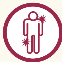
Muscle aches and fatigue