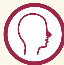
Loss of smell or taste